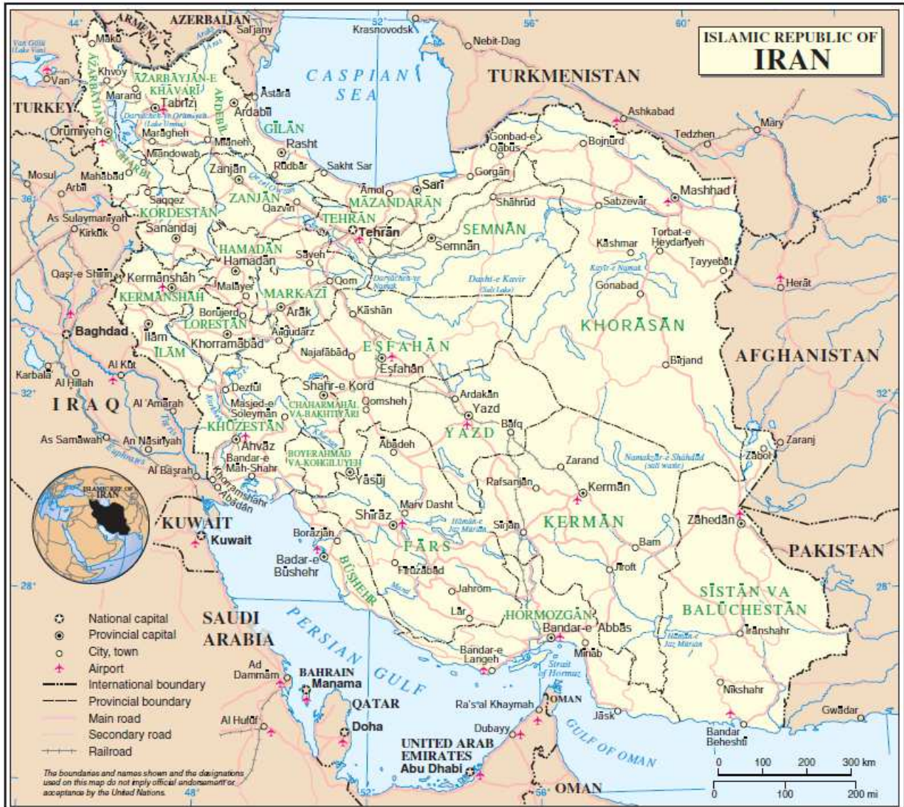
Map No. 3891 Rev. 1 UNITED NATIONS January 2004

Department of Peacekeeping Operations Cartographic Section